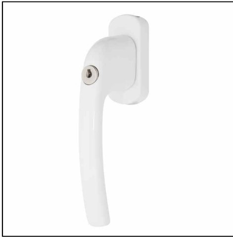
Lockable window handles provide greater security.