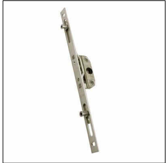
Multipoint locking espagnolette with adjustable mushroom cams provides greater security.

range of applications protecting against “smash and grab” through to bullet resistance. Please speak to your NK Windows representative.